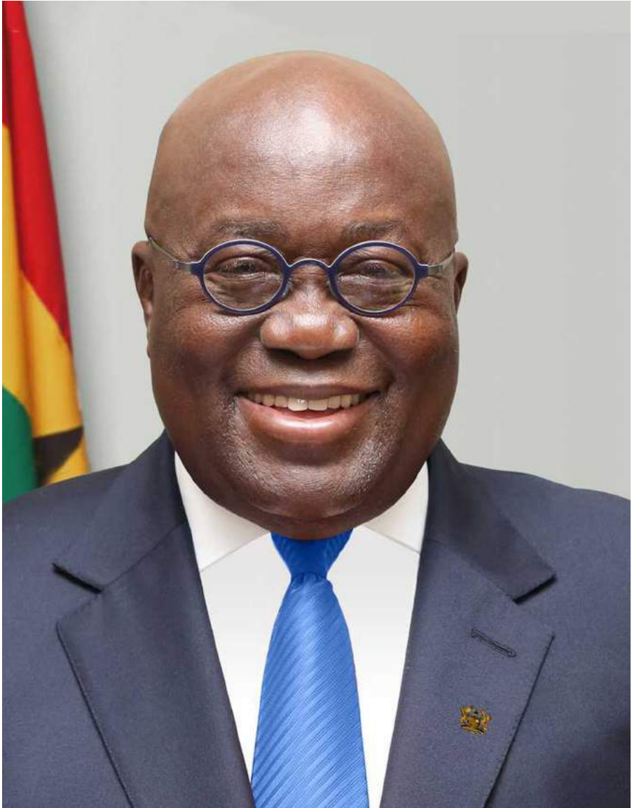
HIS EXCELLENCY NANA ADDO DANKWA AKUFO-ADDO PRESIDENT OF THE REPUBLIC